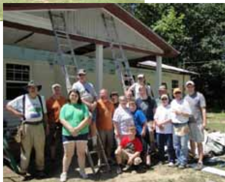
2011 Henderson Settlement Team